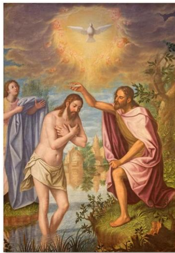
The Baptism of Christ by Juan Sánchez Cotán

In the week of the 6th of October, children will learn more about Jesus by praying the Rosary. Children will invite the Holy Spirit to open their hearts and minds as they reflect on the set of five stories and events called the Luminous Mysteries - the Mysteries of Light!