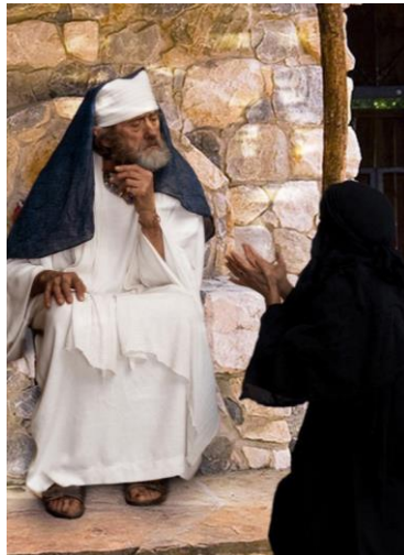
Image 2 Persistent Widow by Free Bible Images . Licensed under CC BY SA 4.0

The assembly for the third week of October focuses on persistence, and especially persistence in prayer. Through explorations of the parable of 'The Persistent Widow' and the fable, 'The Tortoise and the Hare', children will discover that prayer leads to a deeper friendship with God.